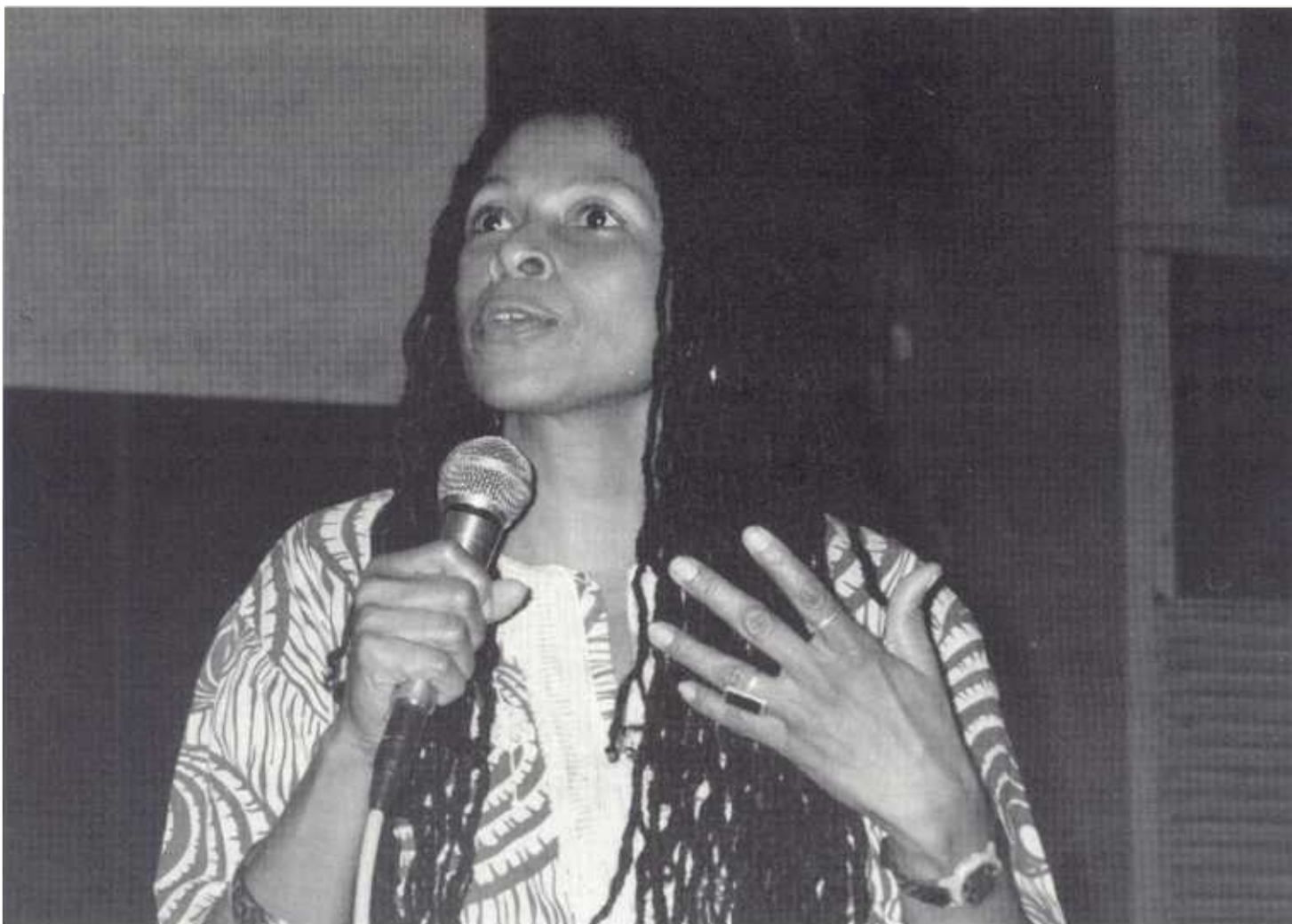
Assata speaking to U.S. Women's delegation, Havana, Cuba, January 1998.