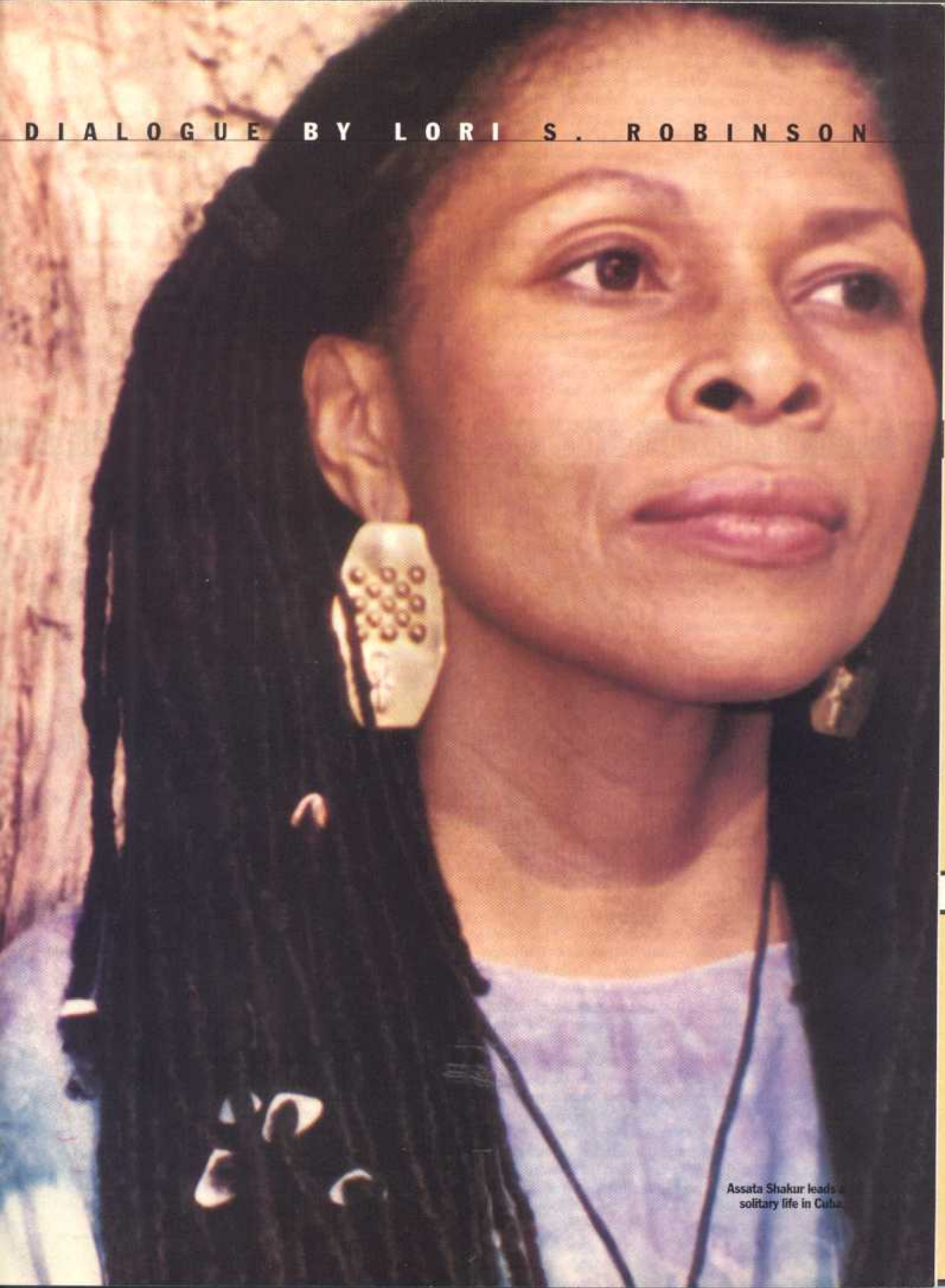
Assata Shakur leads a solitary life in Cuba.